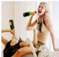
Millennials are Drinking so Much Wine They're Changing How... PARADE