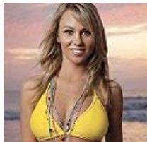
The Hottest MLB WAG From Every Team RantSports