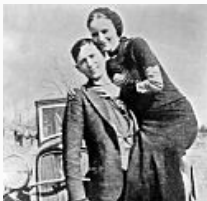
6 Things You Didn't Know About Bonnie and Clyde Ancestry.com