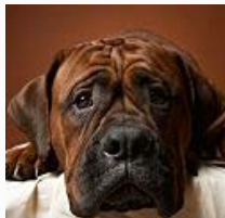
14 Of The Worst Behaviors You're Teaching Your Canine Poundwishes